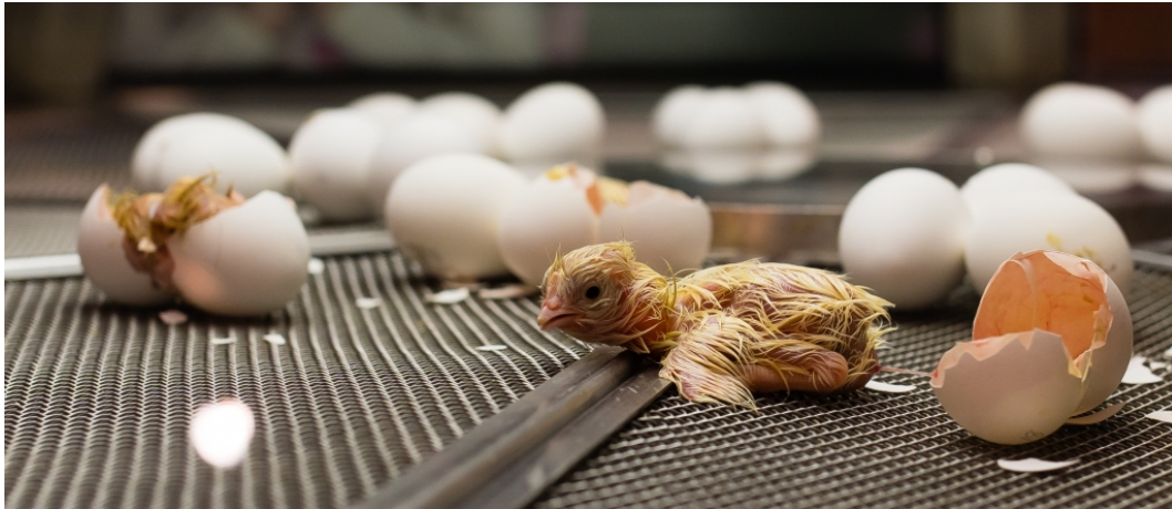
Hatchling Top Choice by Judge Win Boon