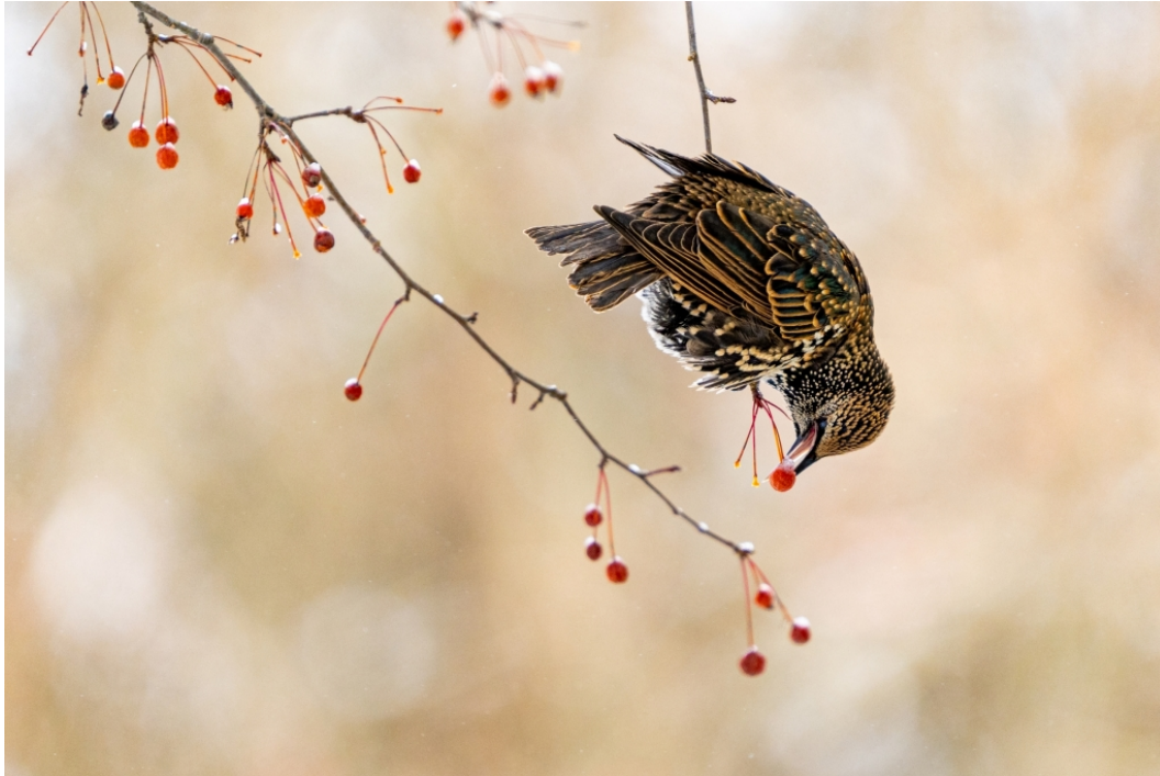
European Starling Top Choice by Judge Scott Straub